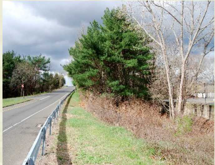
An every day view of the Papa Property