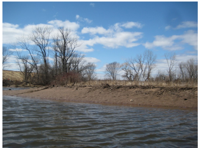
Humphrey Property as seen from Quinnipiac River

If you happen to be out kayaking on the Quinnipiac River, just south of the railroad trestle on Stiles Lane is the site of the former Humphrey Chemical Company. The land was gifted to the Land Trust in 1974. Unfortunately, about the only way to see the property is by kayak. The land adjoins the former Upjohn site, now owned by Pfizer. As you travel south on the Route 40 connector you may see plenty of activity on the Pfizer property where there is ongoing remediation activity to clean the site for potential future use.